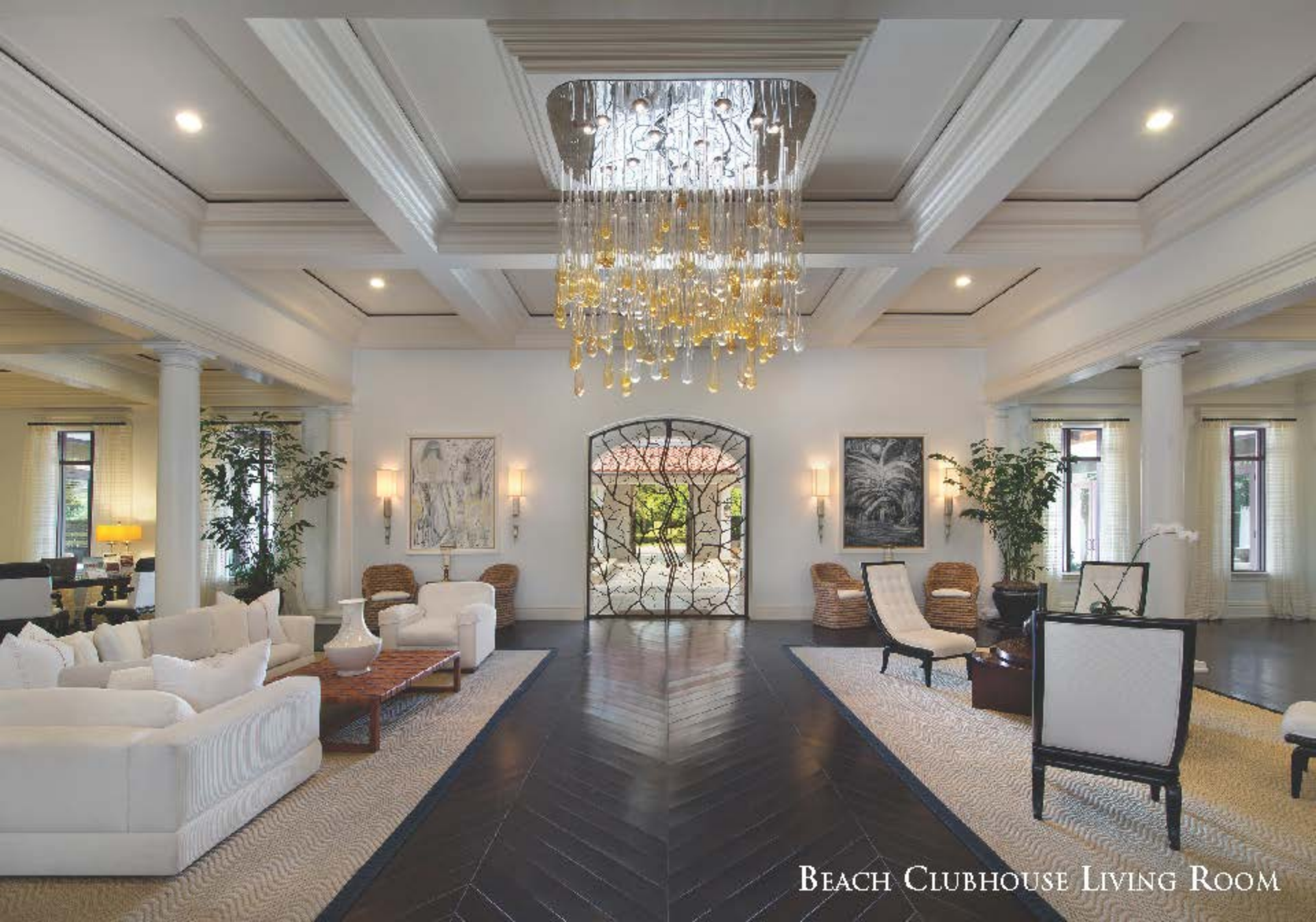
BEACH CLUBHOUSE LIVING ROOM