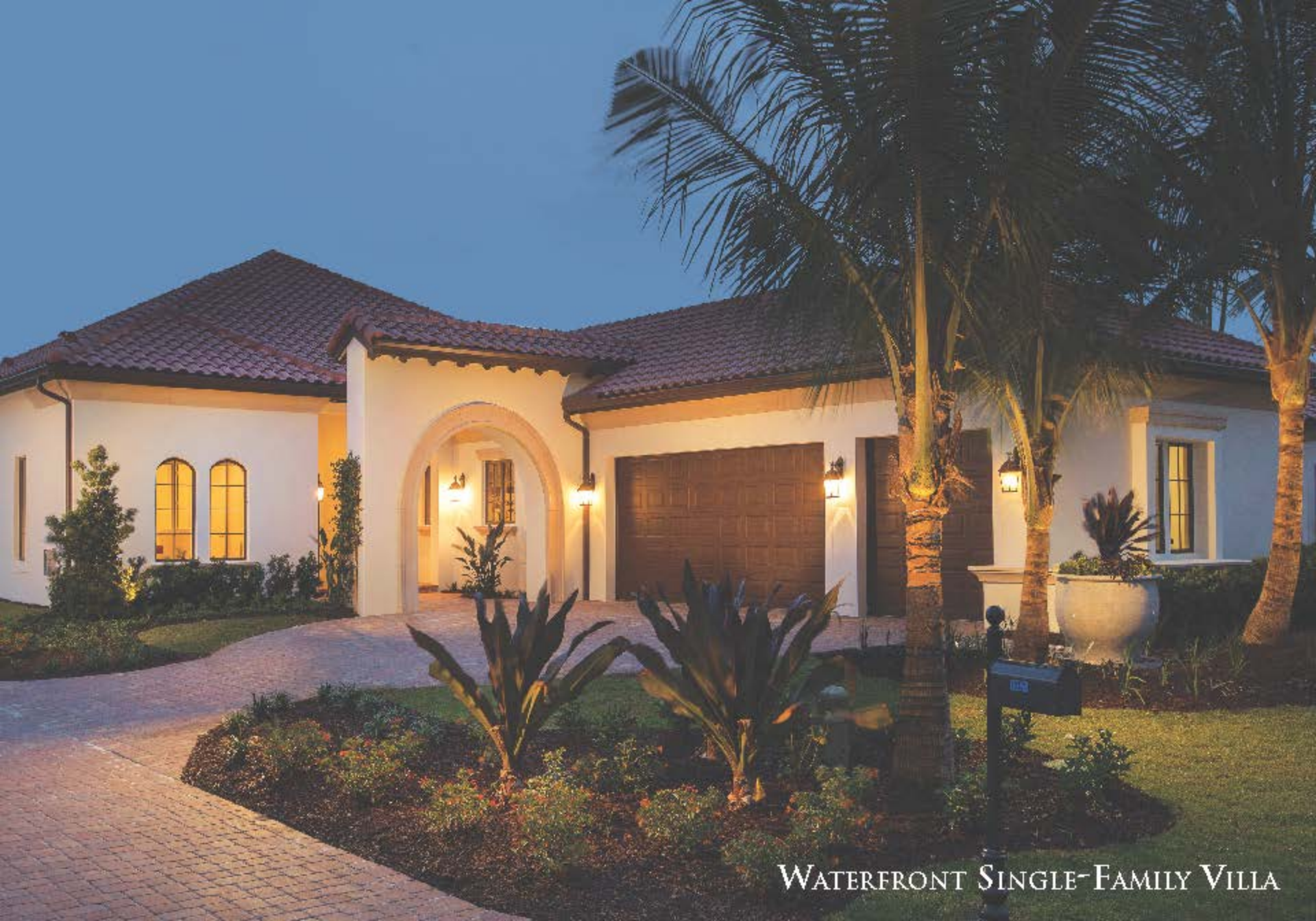
WATERFRONT SINGLE-FAMILY VILLA