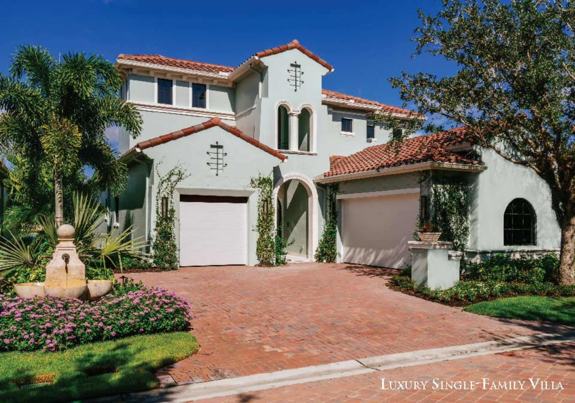
LUXURY SINGLE-FAMILY VILLA