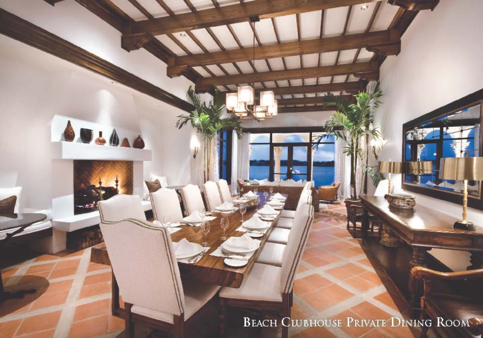
BEACH CLUBHOUSE PRIVATE DINING ROOM