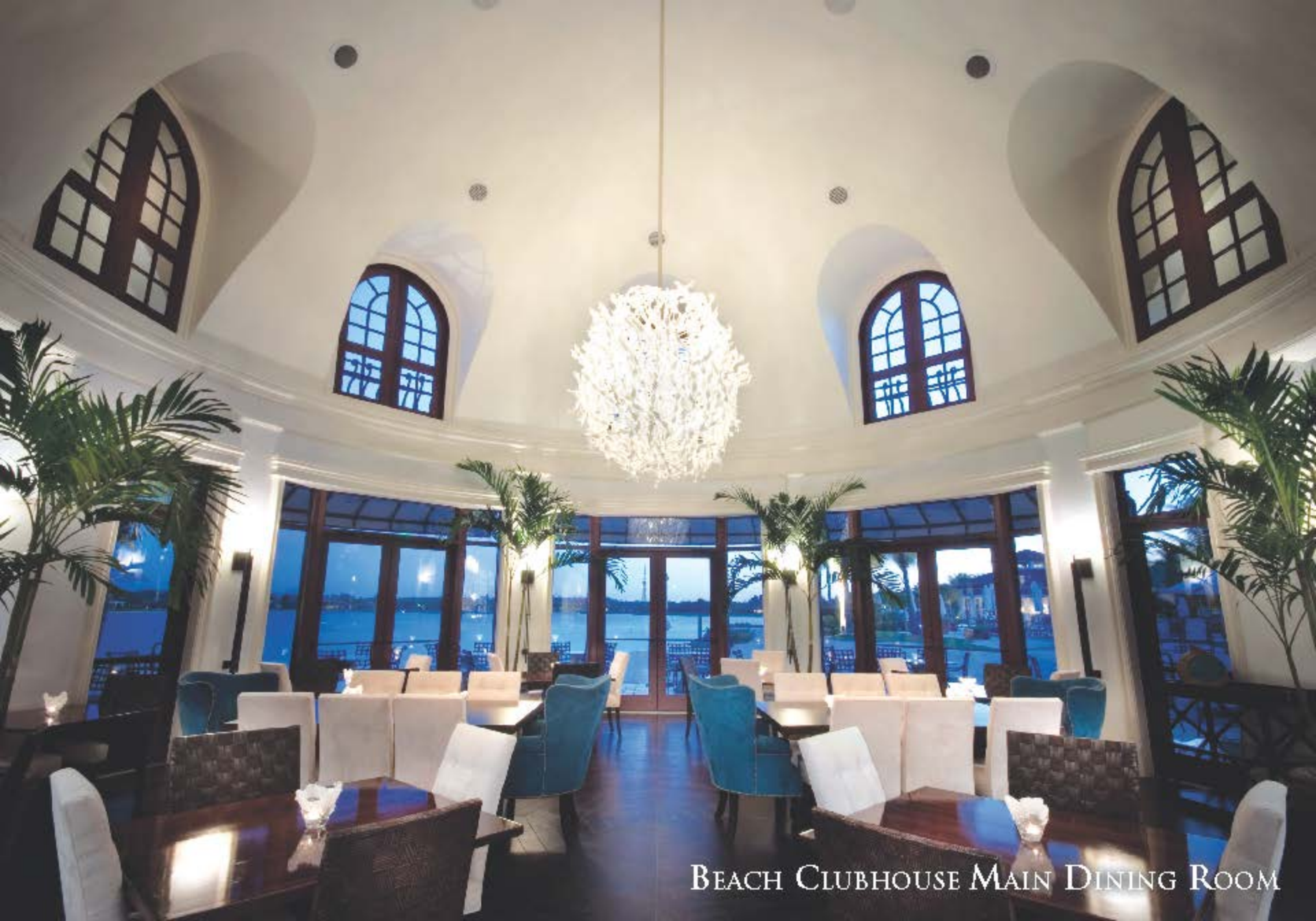
BEACH CLUBHOUSE MAIN DINING ROOM