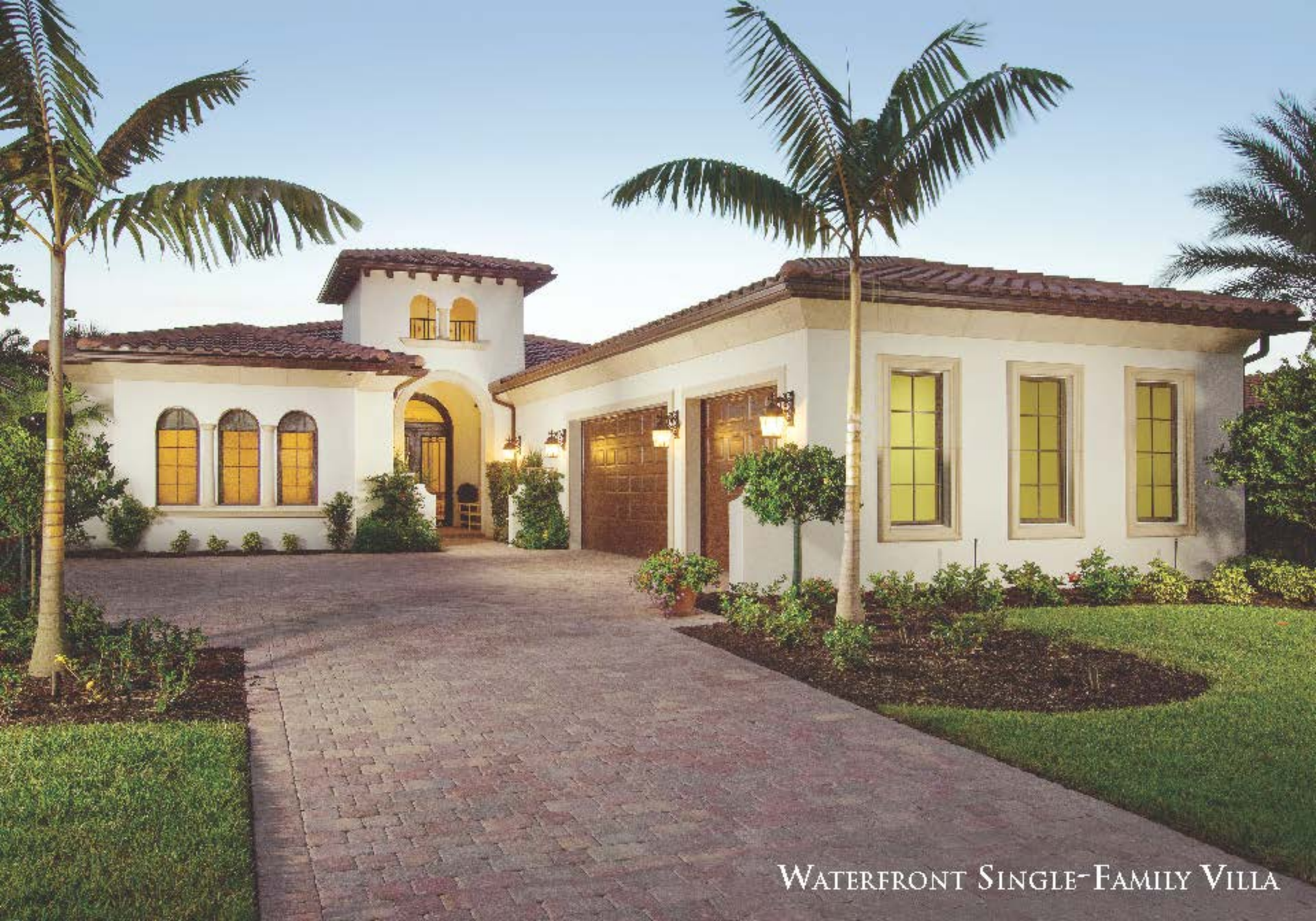
WATERFRONT SINGLE-FAMILY VILLA