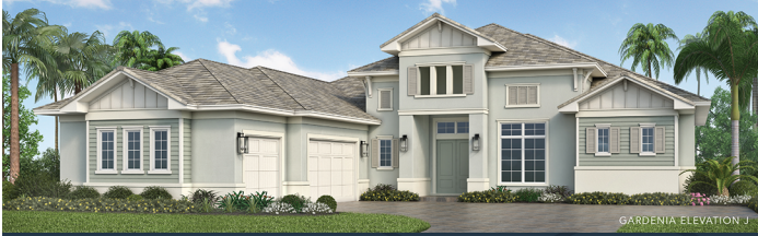
GARDENIA ELEVATION K