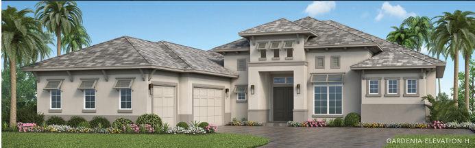
GARDENIA ELEVATION H