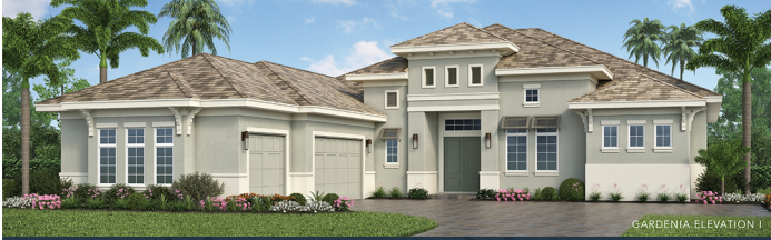
GARDENIA ELEVATION J